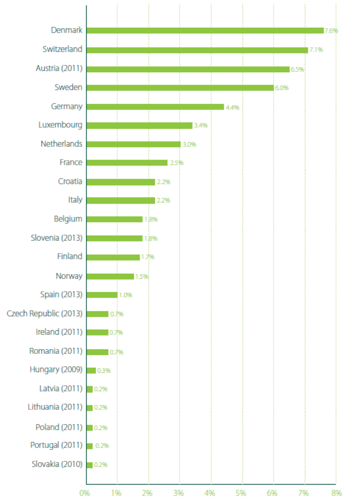
Figure 2: Proportion of organic retail sales in Europe by country (2014)