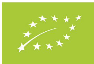
Figure 3 - The EU organic label

Where terms such as organic, bio and eco are used, the logo is compulsory when labelling and advertising organic pre-packaged food products placed on the EU market. If used on a product, the logo indicates that this product is in full conformity with the conditions and regulations for the organic farming sector established by the European Union. This means that the product has been: