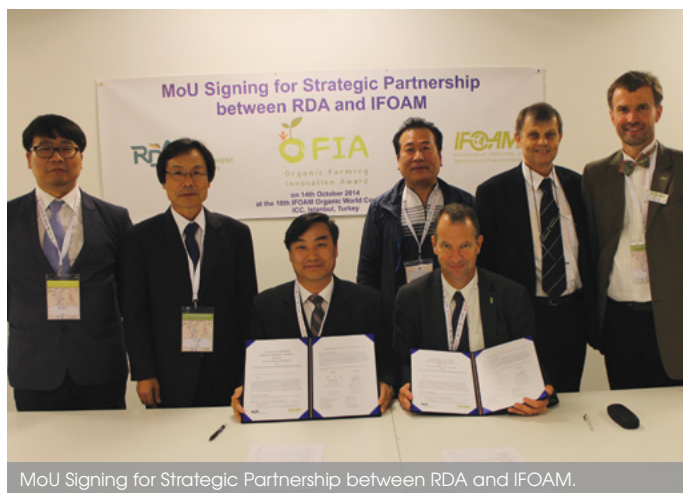
MoU Signing for Strategic Partnership between RDA and IFOAM.

We congratulate the winners and look forward to honoring more organic farming innovators at the next OFIA ceremony!