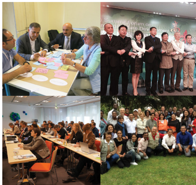
The Sector Platforms in Action.