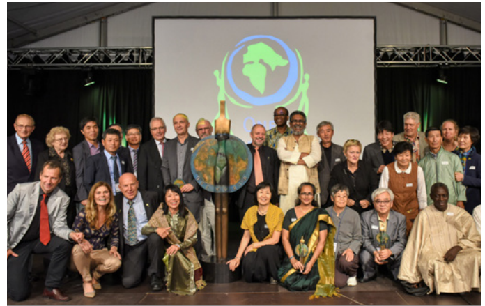
OWA - The Winners 2014