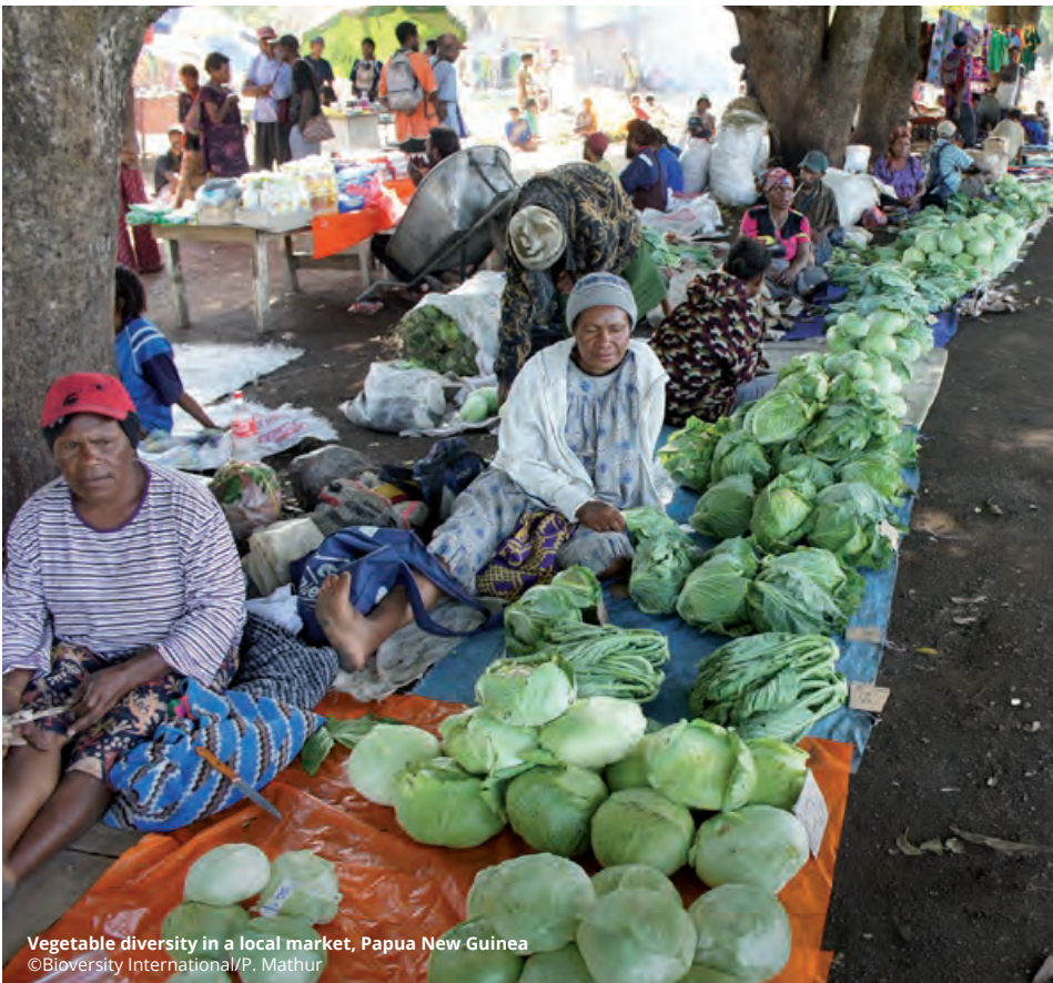
Vegetable diversity in a local market, Papua New Guinea

Realistic and detailed cost estimates for all proposed activities supporting on-farm management will help to facilitate the mobilization of resources and funding. Financial mechanisms need to be set up and articulated in ways that will survive change in people, policies and governments. To establish a long-term funding mechanism in support of on-farm management of farmers' varieties/landraces it will be necessary to have a clear statement from the government and stakeholders of the importance and commitment to this activity.