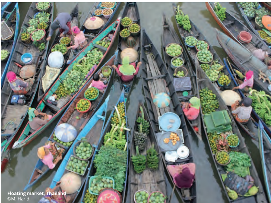
Floating market, Thailand

More information available at www.diva-gis.org