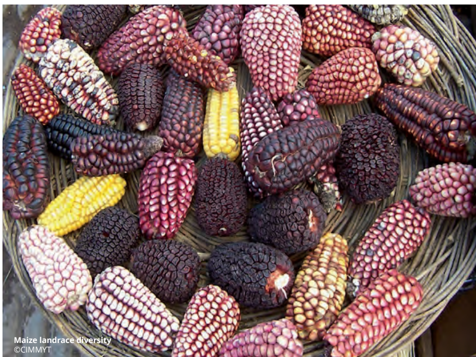
Maize landrace diversity